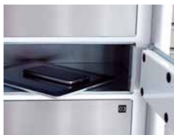
Work equipment management