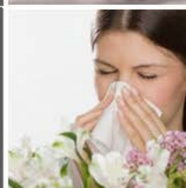
POLLEN AND ALLERGENS