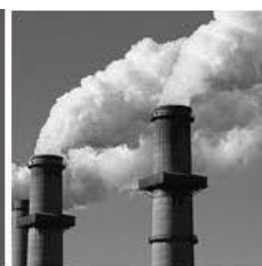
POLLUTION FROM INDUSTRIES