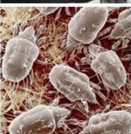
MITES AND SIMILAR