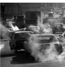
EMISSIONS FROM CARS