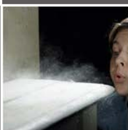
DUST AND FLOATING PARTICLES