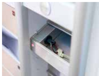
Key & visitor management