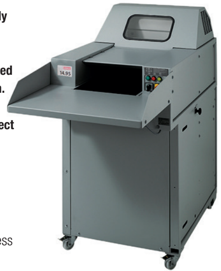
W/D/H 80/120 x 168 x 164 cm

The spacious feed table with integrated infeed conveyor belt provides controlled, effortless, safe and fast loading. The shredded material is collected in large-scale, mobile or swing-out containers under the cutting mechanism. The shred-press combinations are coupled to a baler for immediate fully automatic compaction of the cut material into compact bales. Reduction effect compared to the loose collection of the cuttings is about 70%.