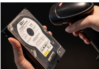
Scans serial numbers of hard disks before erasure