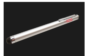
Stylus for comfortable operation of the touchscreen