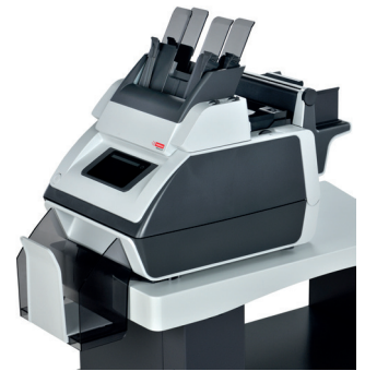
TSI-2.5 S 2.5 STATIONS