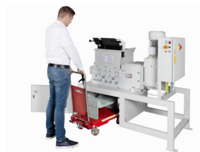
Simple and uncomplicated screen change