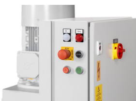
Operation via easy-to-understand pushbuttons