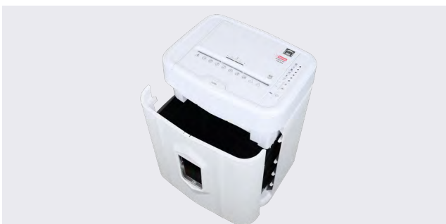
Pull-out 20-litre collection bin.