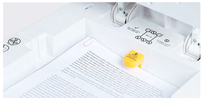
Also shreds documents with paper clips and staples.