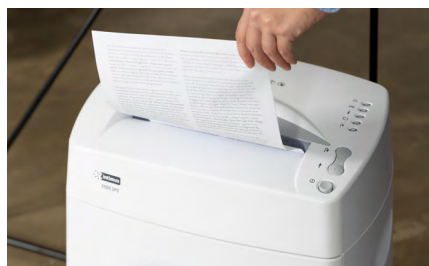
Shreds documents with paper clips and staples.