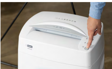
Automatic start/stop function and anti-paper jam technology.