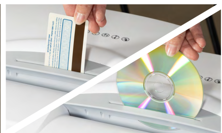
Credit cards and CDs can also be shredded via a separate feeding slot.