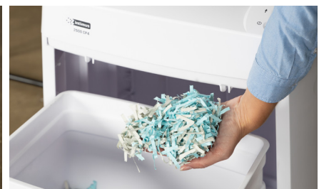
4,3 x 33 mm particles with security level P-4 according to DIN 66399 (ISO/IEC 21964).