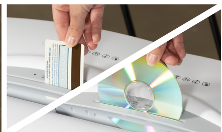
Credit cards and CDs can also be shredded via a separate feeding slot.