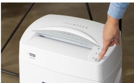
Automatic start/stop function and anti-paper jam technology.