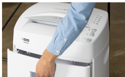
Removable 32-litre collection bin for easy disposal.