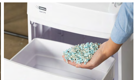
2 x 12 mm particles with security level P-5 according to DIN 66399 (ISO/IEC 21964).