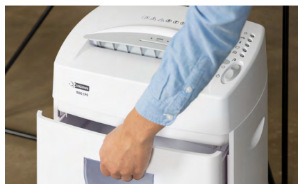
Removable 22-litre collection bin for easy disposal.