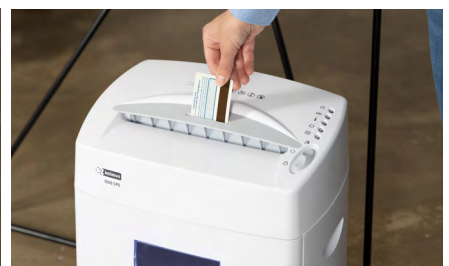
Credit cards can also be shredded via a separate feeding slot.