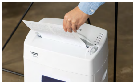
Shreds documents with staples.