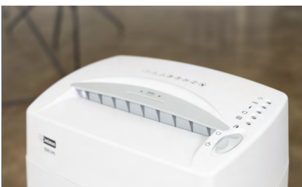
Intuitive operation thanks to clear push buttons and LED indications.