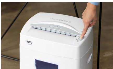
Automatic start/stop function and anti-paper jam technology.