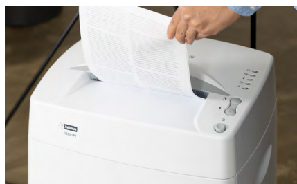
Shreds documents with paper clips and staples.