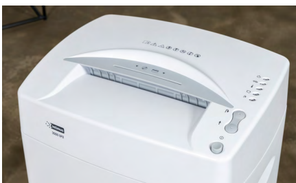
Intuitive operation thanks to clear push buttons and LED indications.