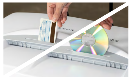
Credit cards and CDs can also be shredded via a separate feeding slot.