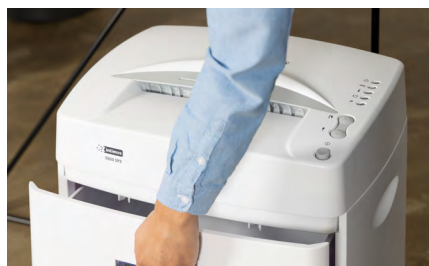
Removable 42-litre collection bin for easy disposal.