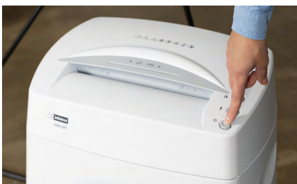
Automatic start/stop function and anti-paper jam technology.