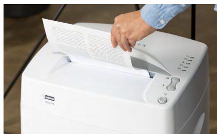
Shreds documents with paper clips and staples.