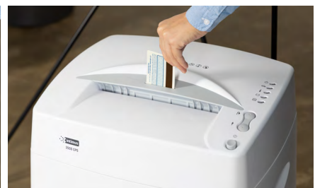
Credit cards can also be shredded via a separate feeding slot.