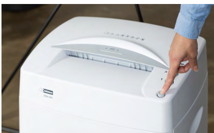
Automatic start/stop function and anti-paper jam technology.