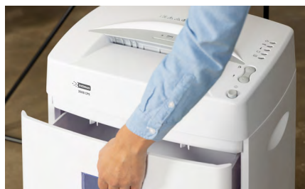
Removable 42-litre collection bin for easy disposal.