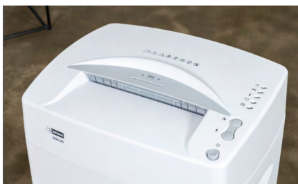
Intuitive operation thanks to clear push buttons and LED indications.