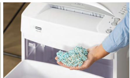
2 x 10 mm particles with security level P-5 according to DIN 66399 (ISO/IEC 21964).