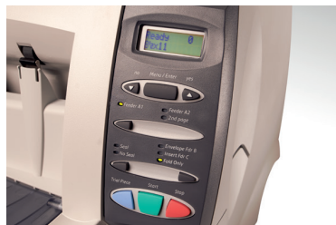
Control panel The simple interface makes job selection easy. Just press and go.