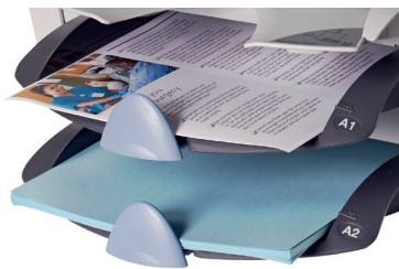
Sheet feeders Load up to 80 sheets. A sheet feeder is included. A second sheet feeder is an available option.