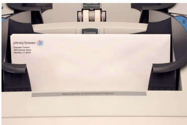
Envelope feeder 60 envelope capacity also lets you load material on the fly for continuous operation.