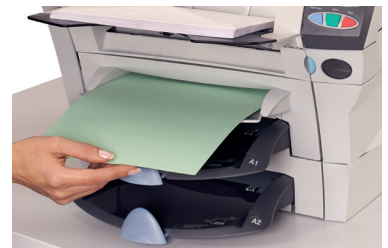
Convenience feeder Give everyday mail a professional look by feeding up to 3-pages stapled or unstapled.