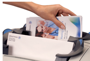
Insert feeder Add impact to your mail piece with a pre-folded brochure, notice or reply envelope.