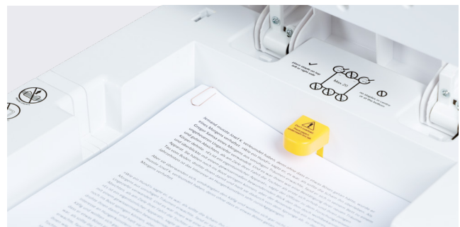
Also shreds documents with paper clips and staples.