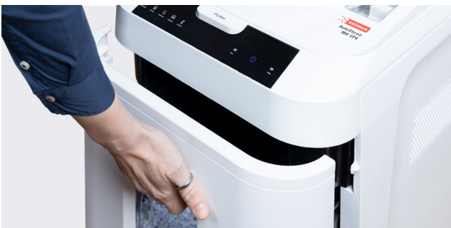
Large 32-litre collection bin.