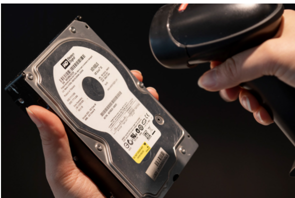
Scans serial numbers of hard disks before erasure