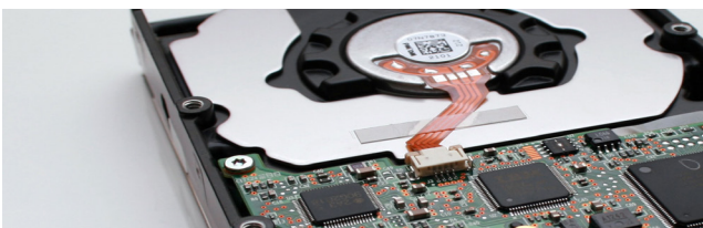
Secure and complete data erasure on hard disks