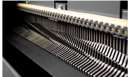
Security shredder (2 x 15 mm particles)