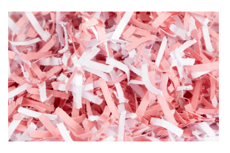
2 x 15 mm particles of security level P-5 according to DIN 66399 (ISO/IEC 21964)