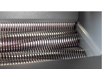
Pre-shredder (6 x 50 mm particles)