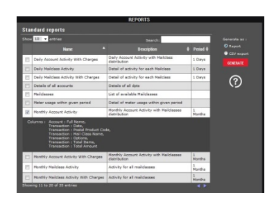
Reporting model with standard and customized reports